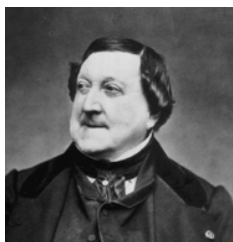
Clockwise from the left : Rossini, Parry, Bruckner, Brahms.

Looking forward to seeing you all again on Monday 3rd September.